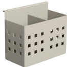
Double Pen Holder