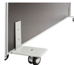
Free Standing Feet